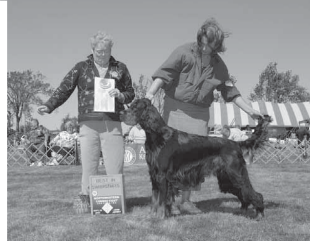
Best In Sweeps: Sandpiper Dlcar's Rumor For Shore