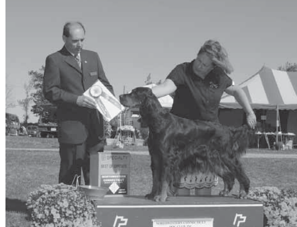
Best Of Opposite Sex: Ch. Kingpoint Woodsmoke Echo, JH