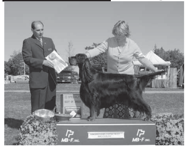
Best of Breed: Ch. Brodruggan Black Knight