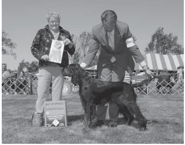
Best of Opposite in Sweeps: Sandpiper Sound Waves