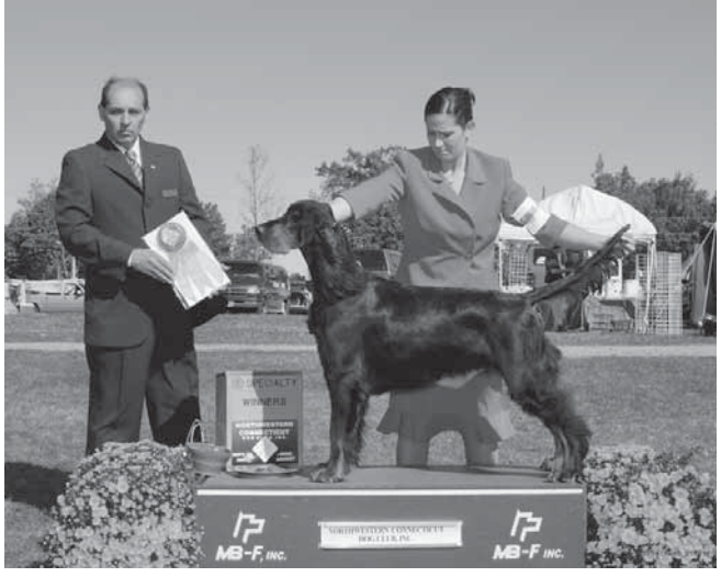
Winners Dog: Windcrest Movin' Out