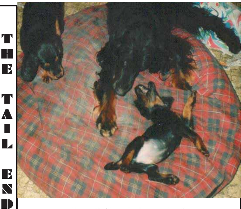
Land Shark Attack !!