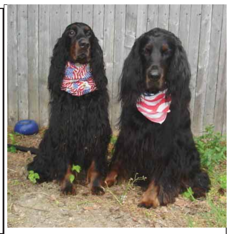
Happy Birthday America!!!