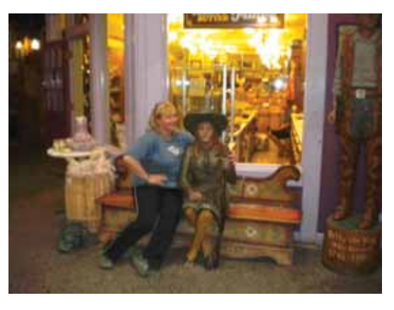
drove off that cliff !!!!