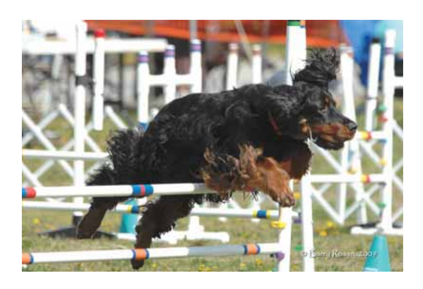
2006 & 2007 GSCA National Best of Opposite Sex Group wins and multiple group placements

Now competing successfully in the agility ring Owner handled in all of her venues Woodsmoke's latest GSCA BBB