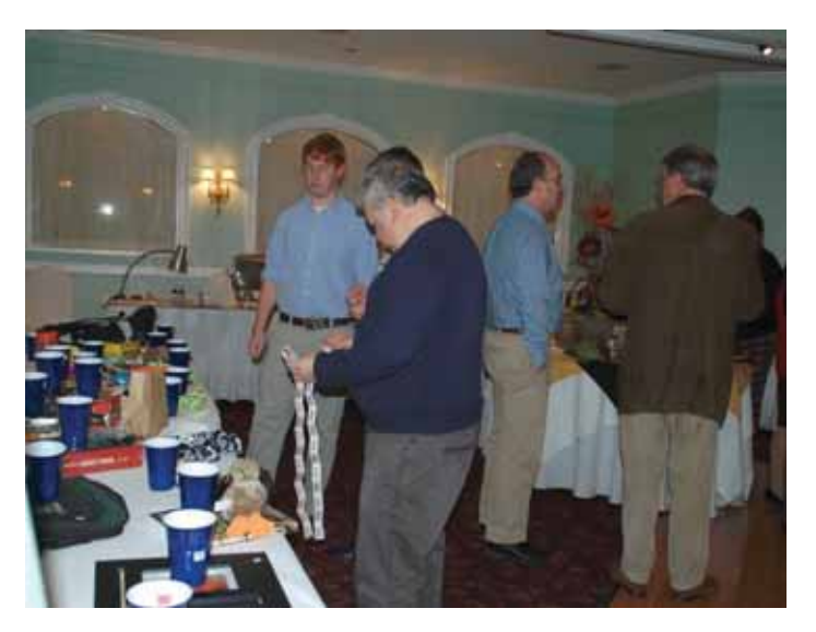
So many neat raffle choices... which cups do I put my tickets in?