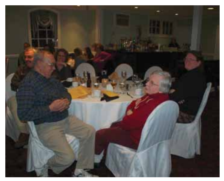
That was very funny!