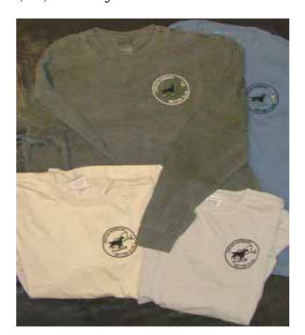
Long sleeve T $25