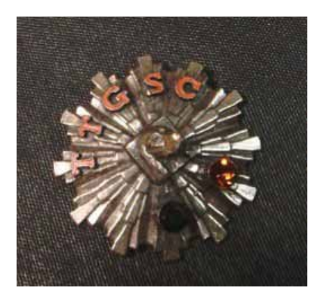
Tam pin (antique $6