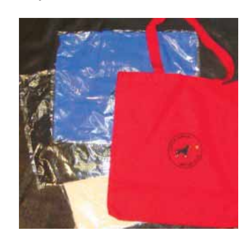
Patch $1 Tote bag $20 Setter Pen $5