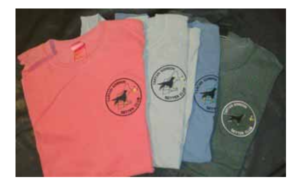
Short sleeve T (color or black logo) $20