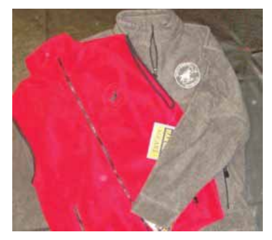
Fleece vest $,40, Fleece jacket $45