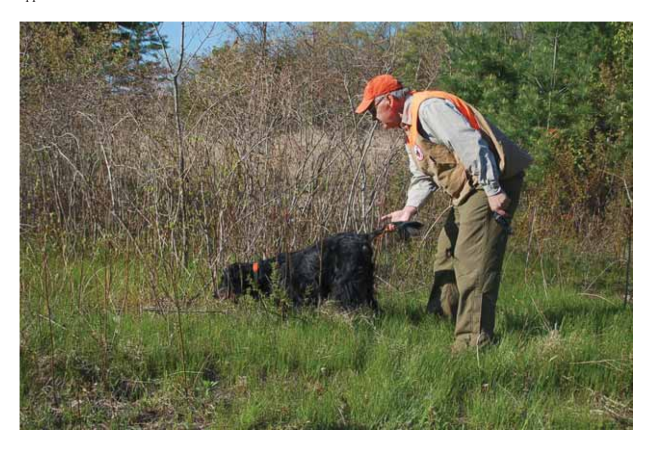
To see more hunt test photos, go to www.canineactionphotos.com