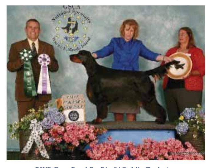
RWB/Best Bred By Bit O'Gold's Technique