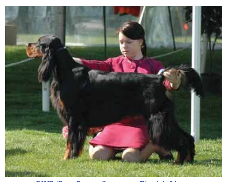
RWD/Best Puppy Stargazer Finnish Line