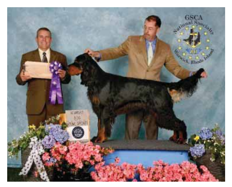
WD Brynbar Tamarack Sonic Boom