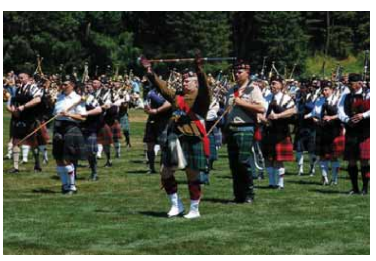
Some of the clans in the parade.