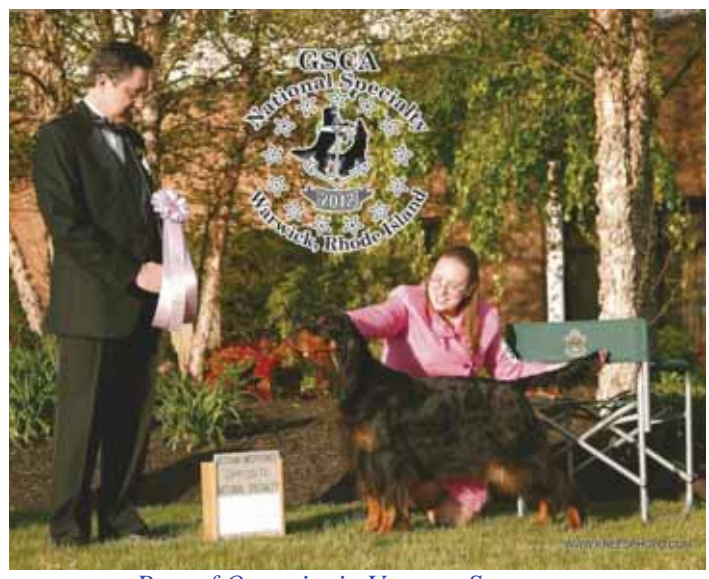
Best of Opposite in Veteran Sweeps Ch Windcrest Some Kind Of Wonderful