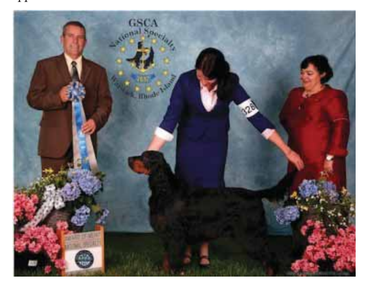
JAM GCh Gilnockie's SevenStrong