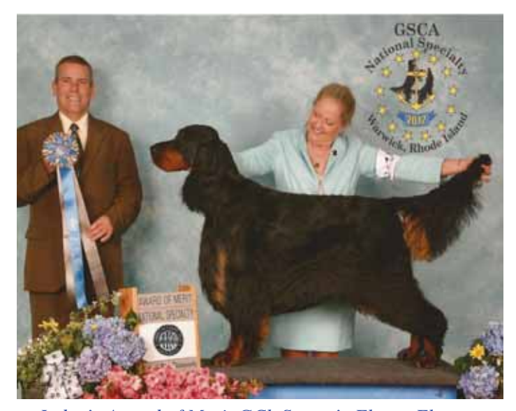
Judge's Award of Merit GCh Sastya's Eleven Eleven