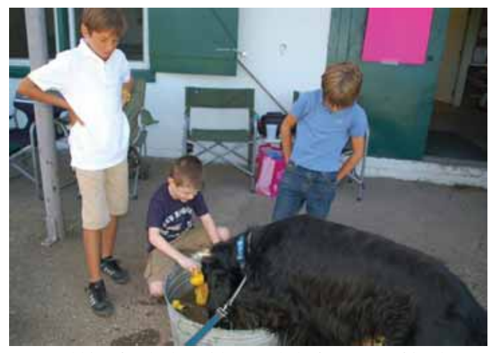
Bobbing for ducks, with some help from some friends.