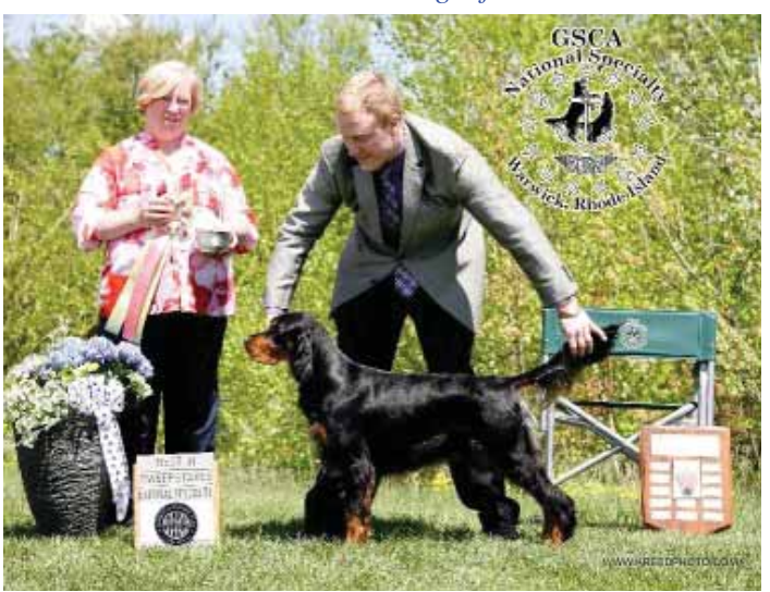
Best in Puppy Sweeps Valley View Elvira