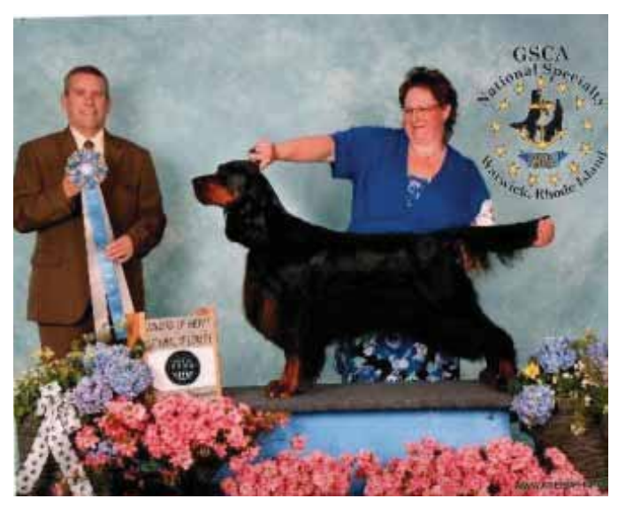
JAM GCh Wildwood's Whirlaway