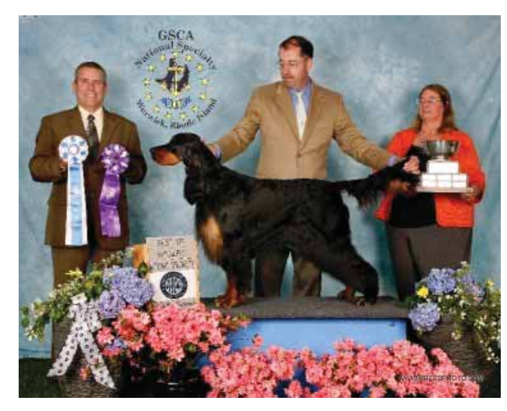
WB/BW Firethorn And SpringRun's Truth Or Consequences