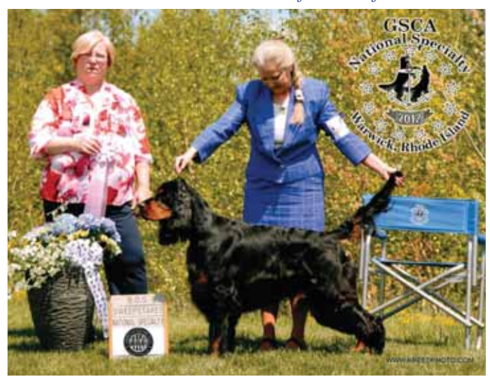
Best of Opposite in Puppy Sweeps Trilogy Sastya Flight Of The Falcon