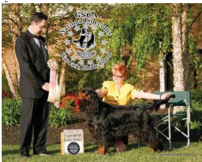
Best in Veteran Sweeps & Judge's Award of Merit AmCan Ch Sassenach King Of The Castle