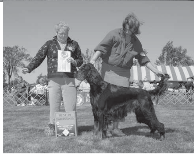
Best In Sweeps: Sandpiper Dicar's Rumor For Shore