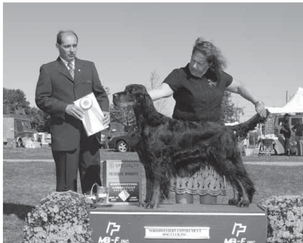
Reserve Winners Dog: Woodsmoke Five O'Clock Whistle