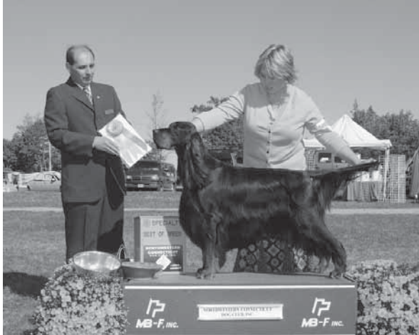
Best of Breed: Ch. Brodruggan Black Knight