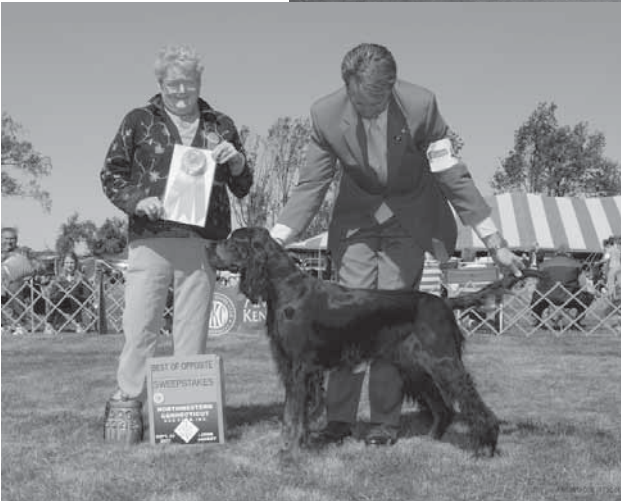
Best of Opposite in Sweeps: Sandpiper Sound Waves