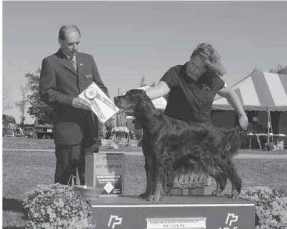
Best Of Opposite Sex: Ch. Kingpoint Woodsmoke Echo, JH