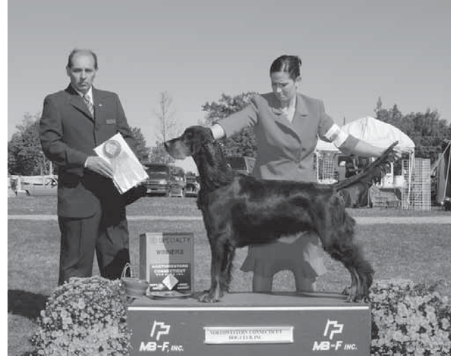
Winners Dog: Windcrest Movin' Out