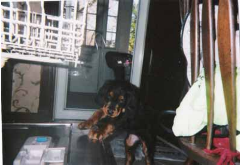
"Junior dishwasher with an attitude! Ma.... where are the dirty dishes?"