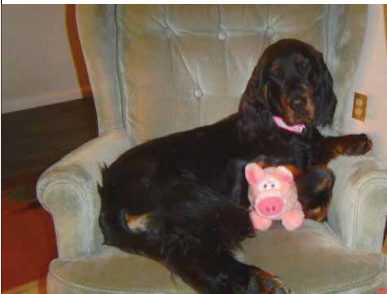
Nothing is better than snuggling with a good friend after a hard days work!