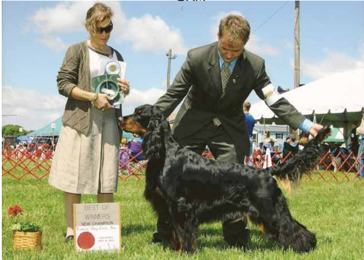
CH SASTYA KILERNAN SORRISI (ISAAC) X RAGGEDEDGE RAISIN SPIRITS (LIBBY)