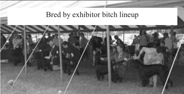
Bred by exhibitor bitch lineup