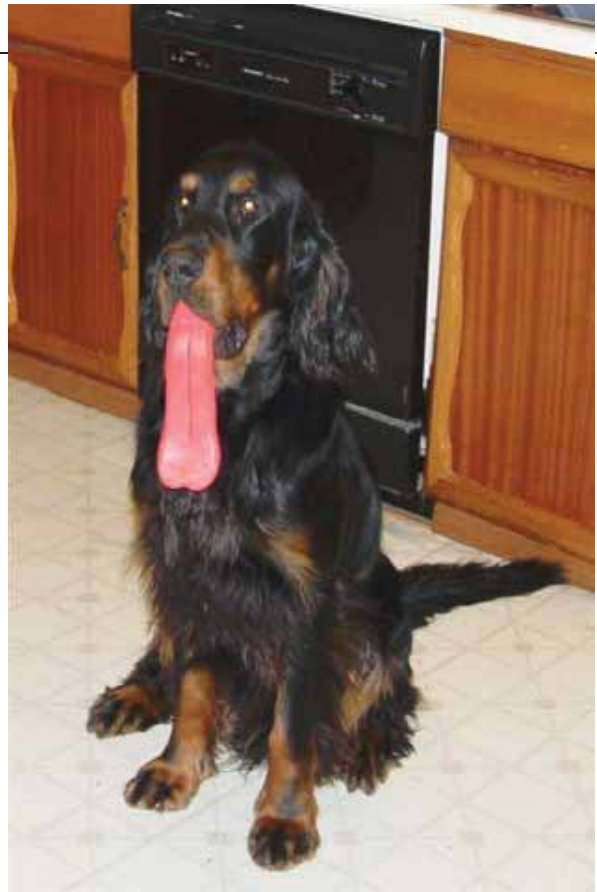
The better to slurp you with, my dear!