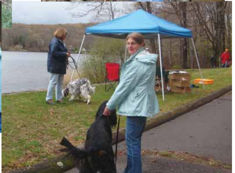
Story on page 5.