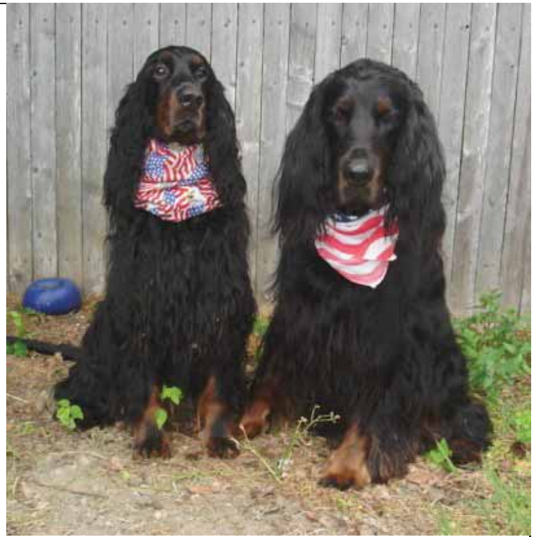
Happy Birthday America!!!