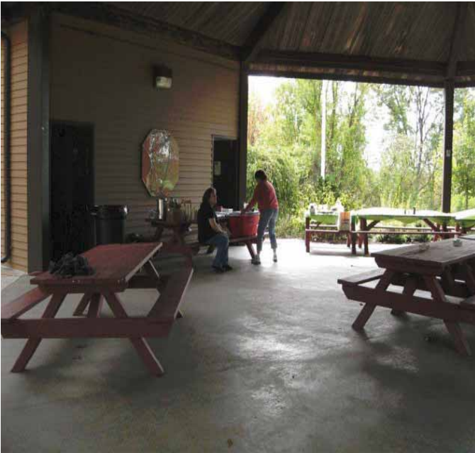
The party's over...