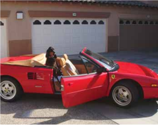
Santa brought this way cool present, but I don't know how to drive!