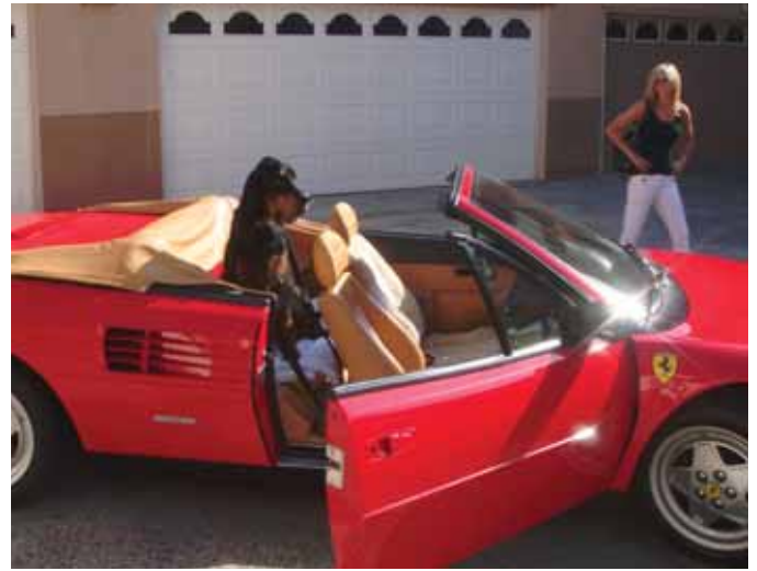
Maybe she'll take me for a ride? Ya think??