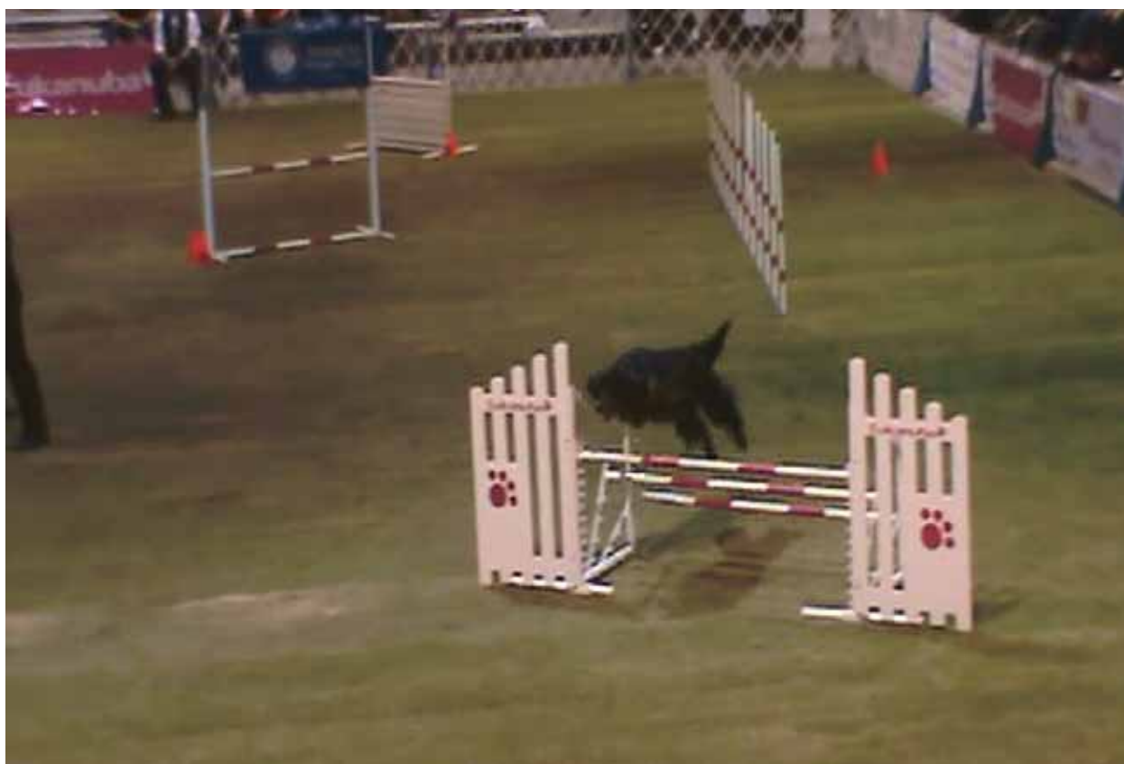
Above: Jake clears the triple jump in the finals.