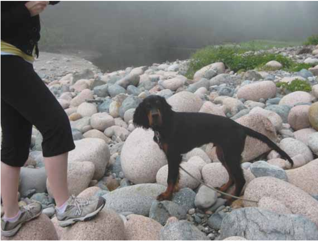
Beachcombing on the rock-bound coast of Maine.