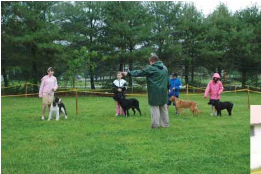
Left & Below, South Shore KC Match, May