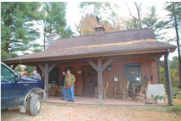
Front of Lodge

On Saturday, April 28th, TarTan will start off the day with the first braces leaving the breakaway at 7:00AM. At or about noontime, we will be taking a short break and then ISCNE will start their hunt test. On Sunday, April 29th, the clubs will swap their start times. Both clubs will be limiting the number of entries accepted in order to complete in daylight hours. Quail will be released for all levels and Chukar for Senior/Master.