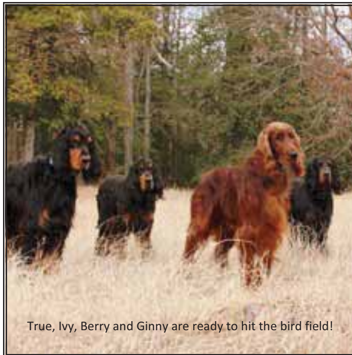
True, Ivy, Berry and Ginny are ready to hit the bird field!