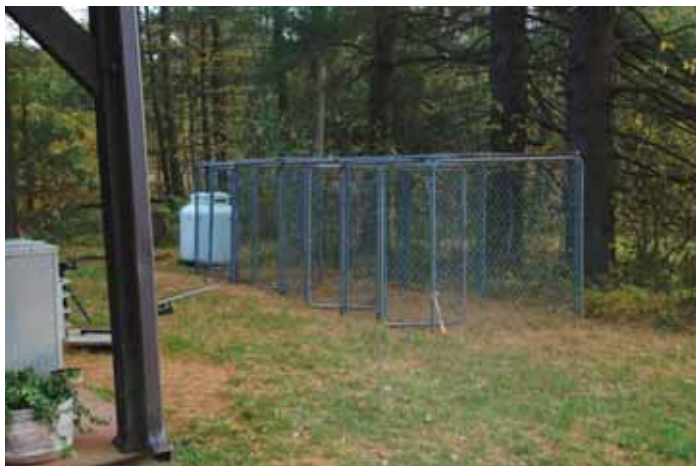
Four-unit Kennel Area