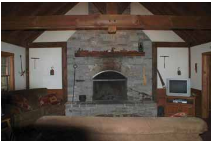
Lounge seating and fireplace

For those of you with RV's there is limited parking for self-contained units. We believe we can get ten RV's in comfortably. I know, we have never had that before, but if you don't think big...well, we won't have to worry about that, because this is going to be the greatest hunt test ever, a don't miss event.