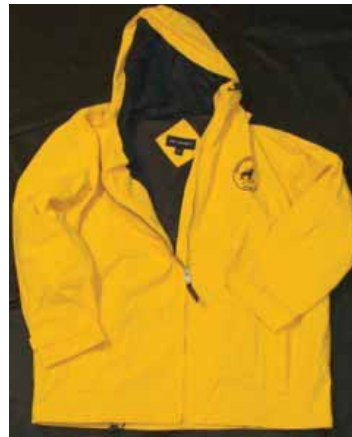
Rain jacket $50