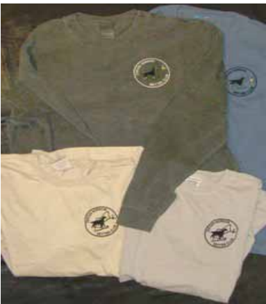
Long sleeve T $25