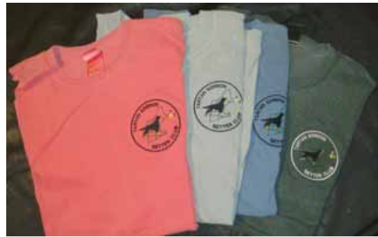
Short sleeve T (color or black logo) $20

Please note: To see color photos of these items if you receive your Tidings in "hard copy" please access this issue on the TarTan website at www.tartangsc.org