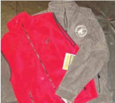
Fleece vest $,40, Fleece jacket $45