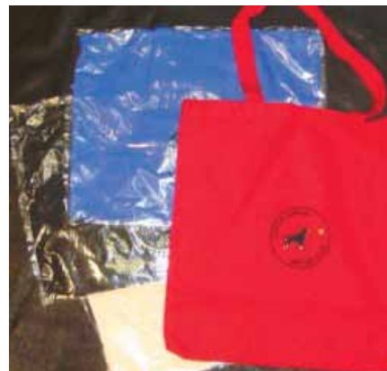
Tote bag $20