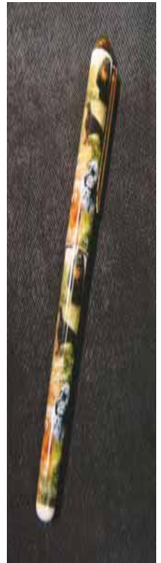
Setter Pen $5