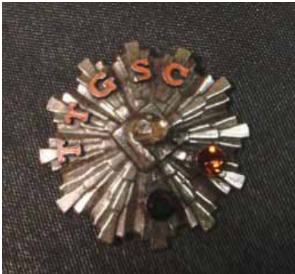
Tam pin (antique) $6